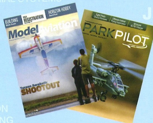
Add Park Pilot magazine for $9.95

Your membership includes Model Aviation, a monthly magazine featuring "how-to" articles, columns, product reviews, AMA member features, district and industry news, an event calendar and more.